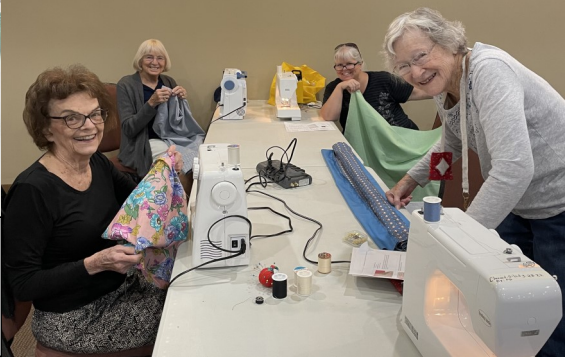
Thread & Thimble Community Service Project Day