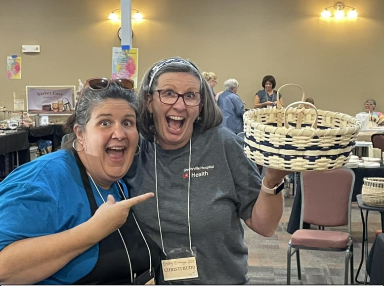
The 3rd Annual Bluegrass Basket Guild Bonanza!