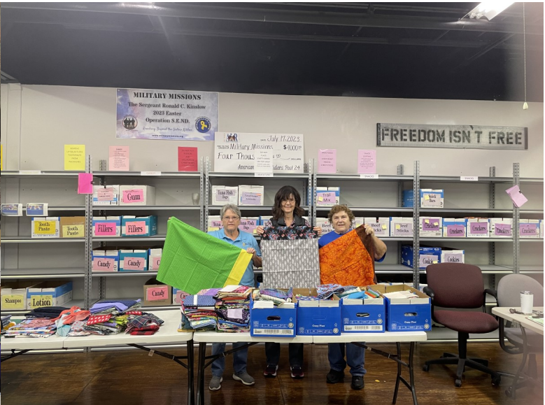
300 pillow cases donated to Military Missions!