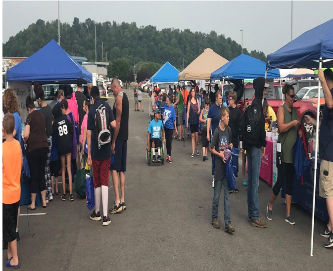
Families at the annual healthfair and readifest